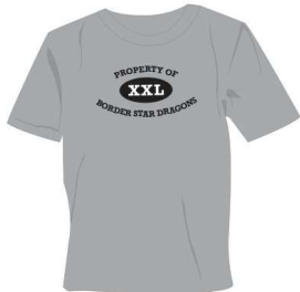
Mens Grey T-Shirt $10 each