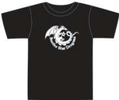
Youth Black T-Shirt w/Dragon $10 each

Please note quantity and size next to each item you want to order.