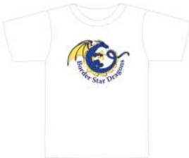
Youth White T-Shirt w/Dragon $10 each