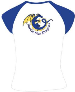
Ladies White T-Shirt w/Blue Cap Sleeve $12 each