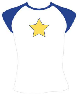
Girls White T-Shirt w/Blue Cap Sleeve $12 each