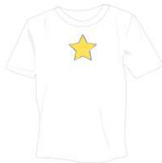
Ladies White Girl Cut T-Shirt $10 each