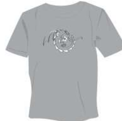
Ladies Heather Grey Girl Cut T-Shirt $10 each