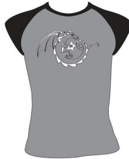
Girls Heather Grey T-Shirt w/Black Cap Sleeve $12 each