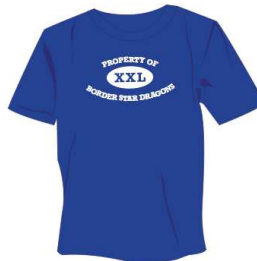
Mens Blue T-Shirt w/Dragon on Side $10 each